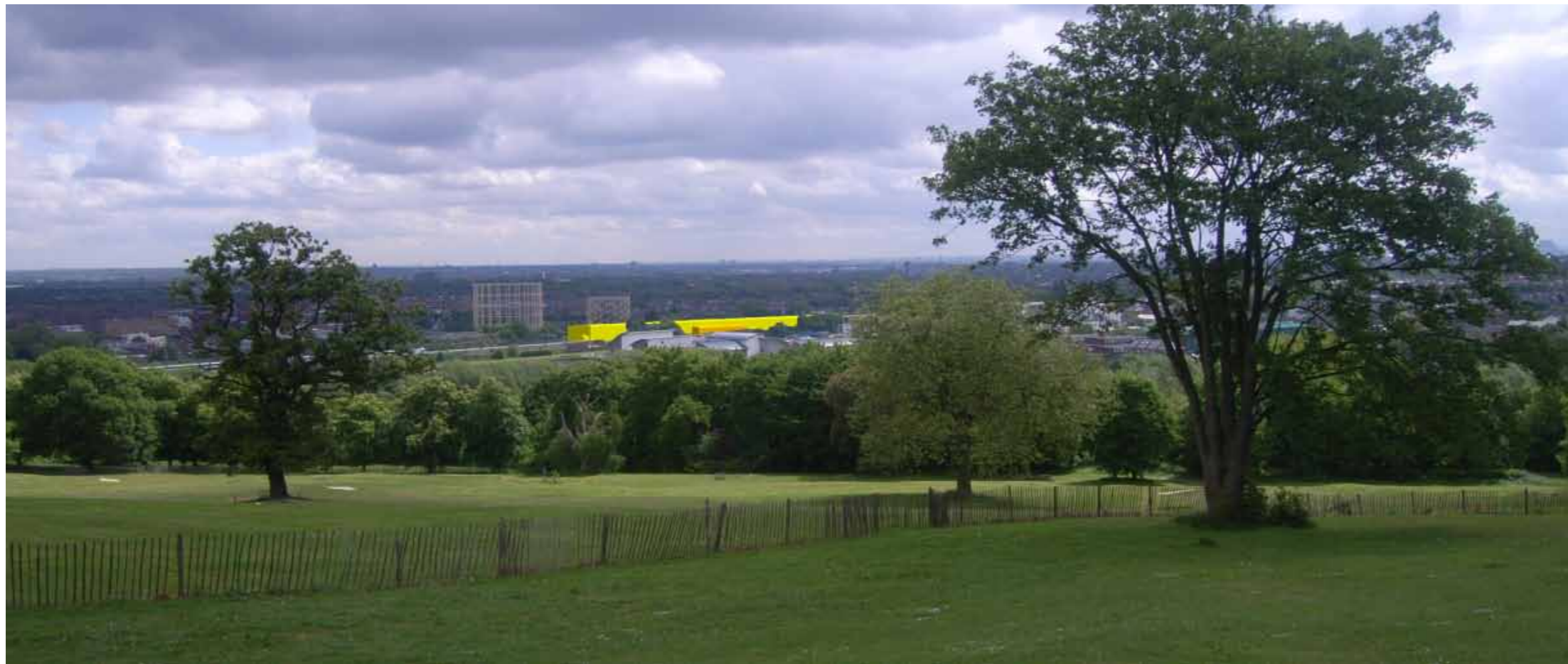
View of proposed scheme